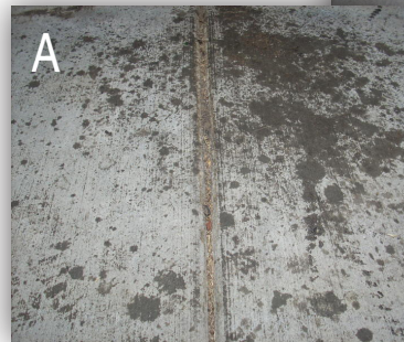
(A) Concrete slab beneath a restaurant dumpster, soiled with grease and food stains.

The bacteria in BackKrete Foaming Food Grease Digester prefer a warm, humid environment for their most active metabolic rate of consumption. Best results are seen after (24) hours' use.